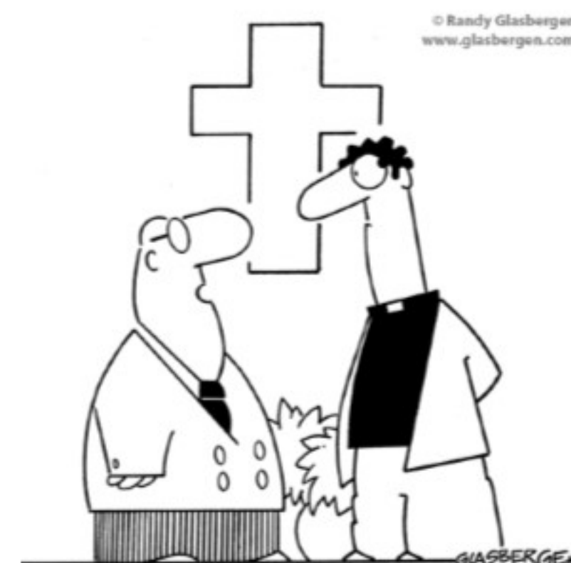
"If I count my blessings and some of them are heavily taxed, do they still count as blessings?"

The North Huntingdon site for the free income tax service provided by AARP's Tax-aide has relocated from the North Huntingdon Townhouse to the lower level of the Norwin Community Resource Center which is located behind Shirley's Funeral Home in Circleville. This site will now be a "by appointment" site and you must make your appointment by calling 724-382-5133 . The Resource Center address is 231 Jennie Drive, N. Huntingdon, Pa. 15642. If you need directions, ask when you call for an appointment.